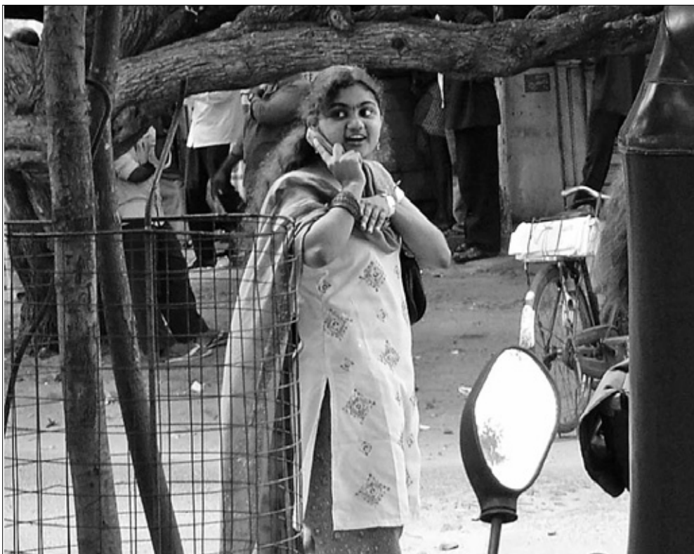
BIG POTENTIAL: India is an ideal adoption ground for solutions like FrontlineSMS. For civil society organisations working with low-income groups, this platform presents exciting communication possibilities

way to and from work, that uses FrontlineSMS to capture the location and gravity of incidents of sexual harassment. The key idea is to get women to report harassment episodes in real time by sending an SMS to a dedicated number. Place and time information is then mapped with another amazing software, Ushahidi, to draw patterns from what would otherwise have been left as isolated data points. Hot spots are then targeted with community activism, awareness campaigns and tools to empower and support women individually and collectively.